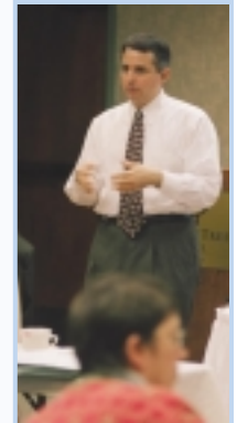
Foundation training for potential grantees.